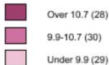
Preterm Birth Rates 2002-2005 Average Percent of live births (87 Counties)

Value ranges are based on an approximately equal number of counties in each range.