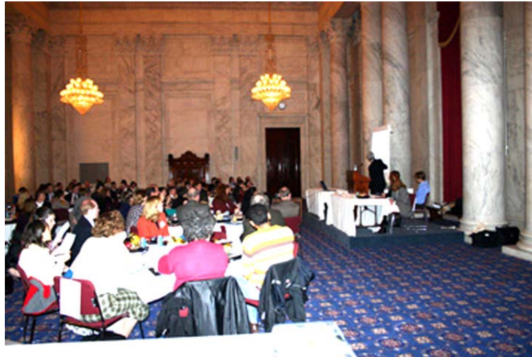
Audience Listens to Presentation at Briefing