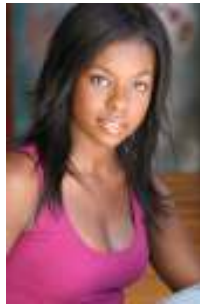
Camille Winbush Actress/Entrepreneur