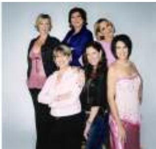
The Miami Bombshells Authors