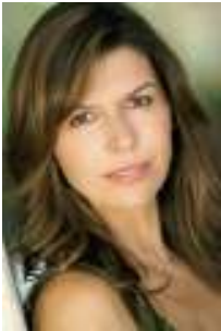
Finola Hughes Emmy-Winning Actress

It IS possible to have it all! Are YOU living life to the fullest power?