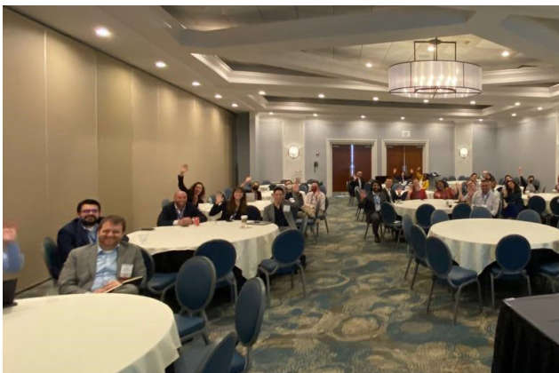
From the podium during the March of Dimes presentation at the Association of Medical School Pediatric Department Chairs (AMSPDC) meeting in March 2023.

Instead of being a spectator at the AMSPDC conference, I presented to a group of curious and incredibly engaged early-stage researchers. My presentation focused on how to work with donor funded foundations like March of Dimes. It outlined how our grant programs differ from government funded programs and endowed foundations, and how that difference allows researchers to directly see the impact of their research.