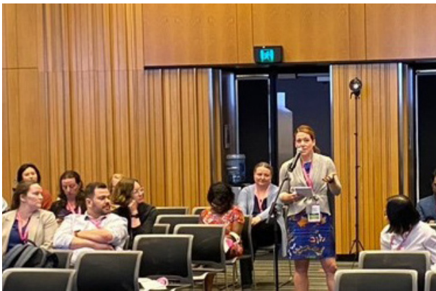
Questions from the audience at the 2023 Annual Meeting of the Society for Reproductive Investigation (SRI) in Brisbane, Australia.

I was incredibly encouraged by the participants' questions and thoughtful replies of the fellow panelists. They tackled tough problems of mentor-mentee relations; how to set-up a productive research collaboration; how to maintain clear communications; and critically, when to recognize the natural end and gracefully exit a collaboration with good relations intact.